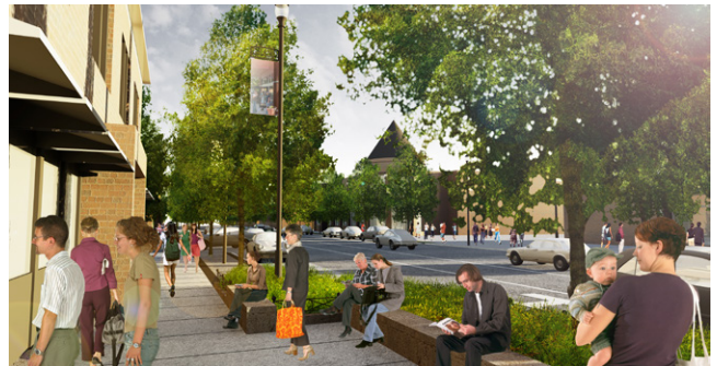
St. Louis South Grand Streets Initiative | Missouri National ASLA Honor Award in Analysis & Planning