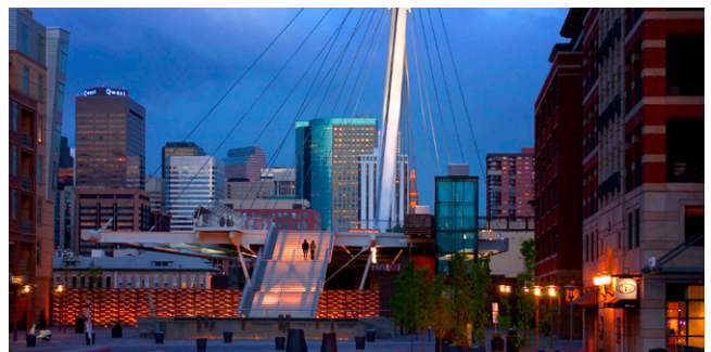
Riverfront Park | Colorado ULI Global Award of Excellence, CNU Plan of the Year