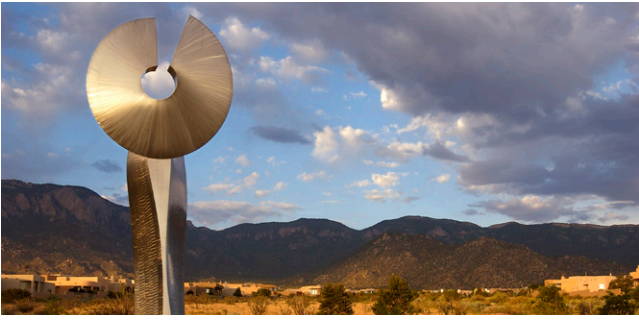
High Desert Community | New Mexico Landscape Architecture Foundation Performance Case