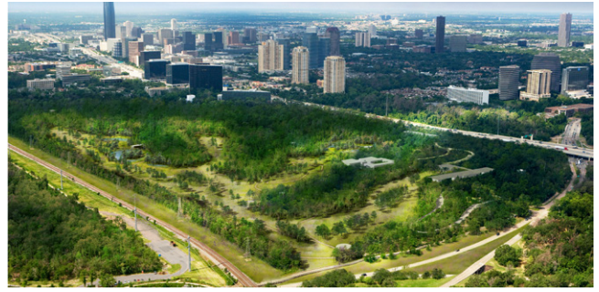
Houston Arboretum & Nature Center | Texas National ASLA Honor Award in Analysis & Planning