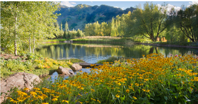
Willoughby Woodland | Colorado Landscape Architecture Foundation Performance Case Study