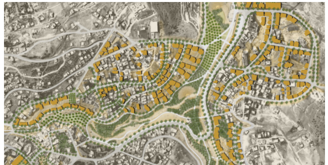
Strategic Master Plan for the Petra Region | Jordan The Pierre L'Enfant International APA Planning Award