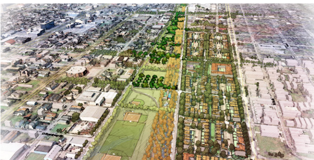
Lafitte Greenway & Revitalization Corridor | Louisiana National ASLA Award of Excellence in Analysis & Planning